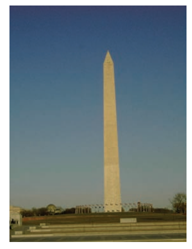
The Washington Monument Washington, D.C.