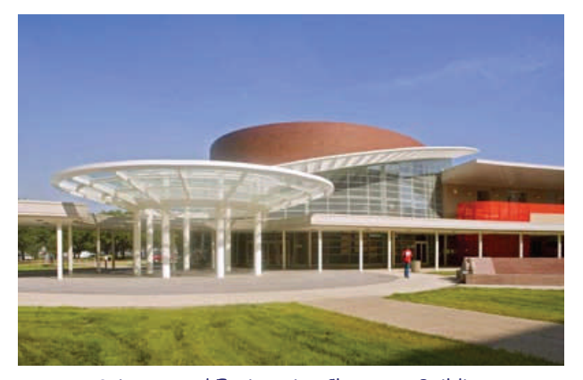
Sciences and Engineering Classroom Building University of Houston